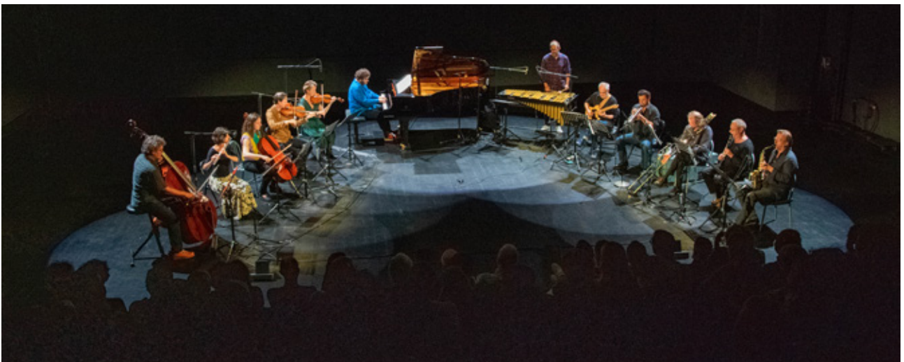
Dedalus