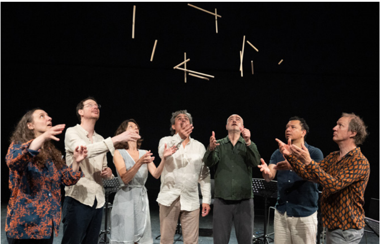
Dedalus © GMEA – CNCM Albi-Tarn