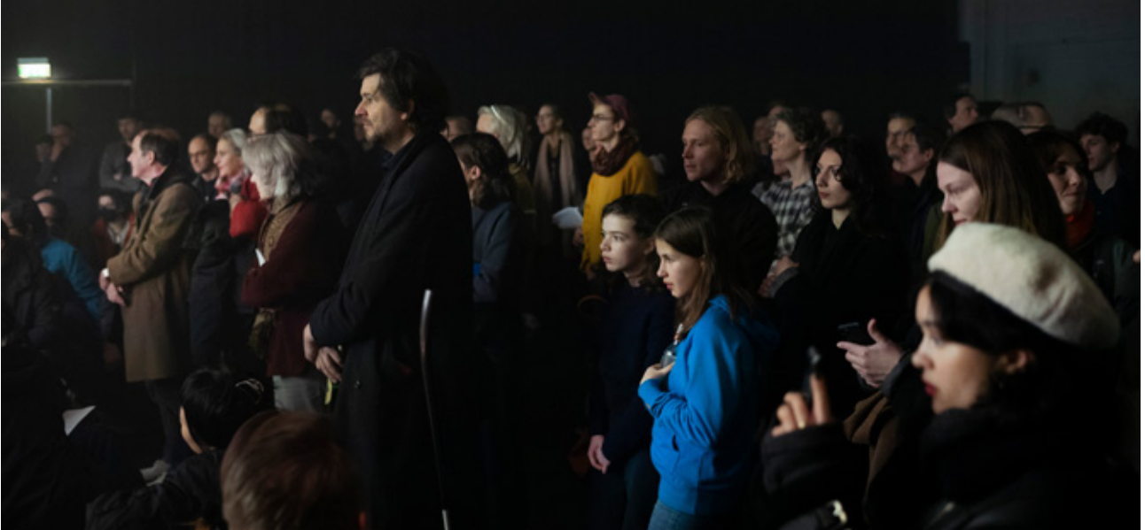
Opening 2023