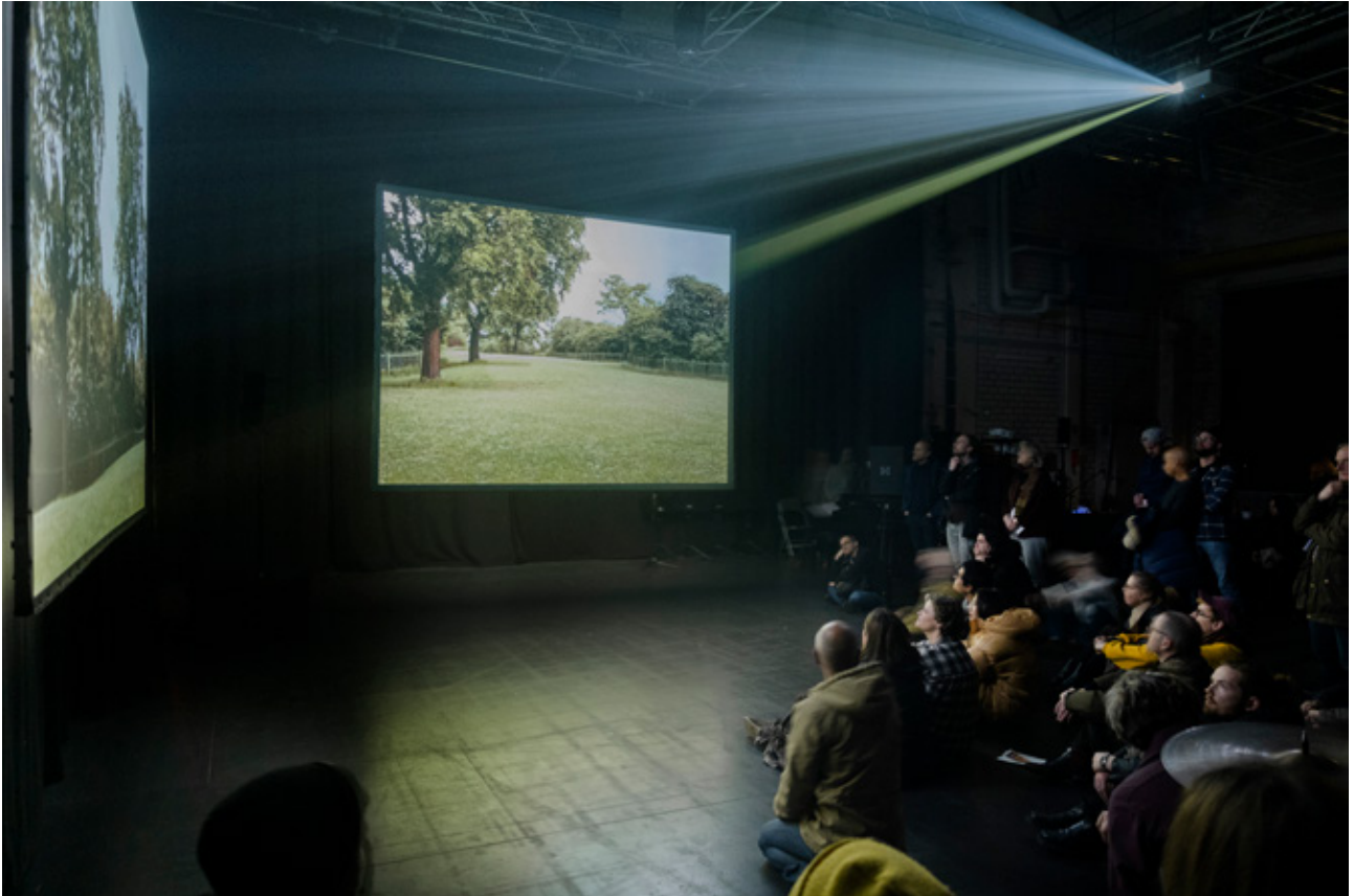
Opening 2023

State as of October 2024 – updates at klubkatarakt.net